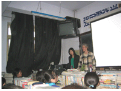
teaching high school students