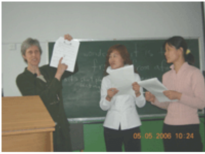
teaching English teachers