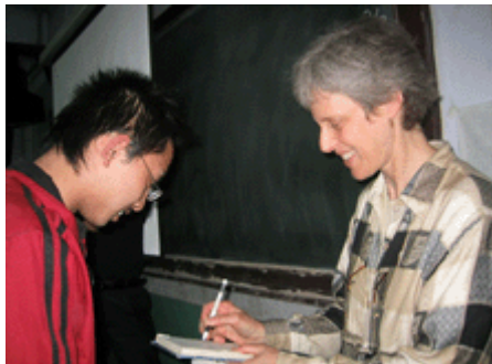
Mr.Susan is communicating with student

http://www.phelex.com/en/highlights/0605cannonteach.htm