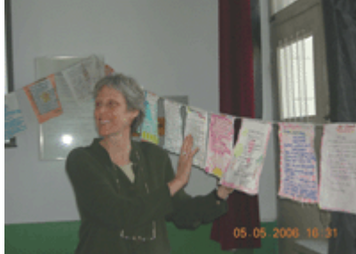
Sharing students' works

http://www.phelex.com/en/highlights/kadirandsusan.htm